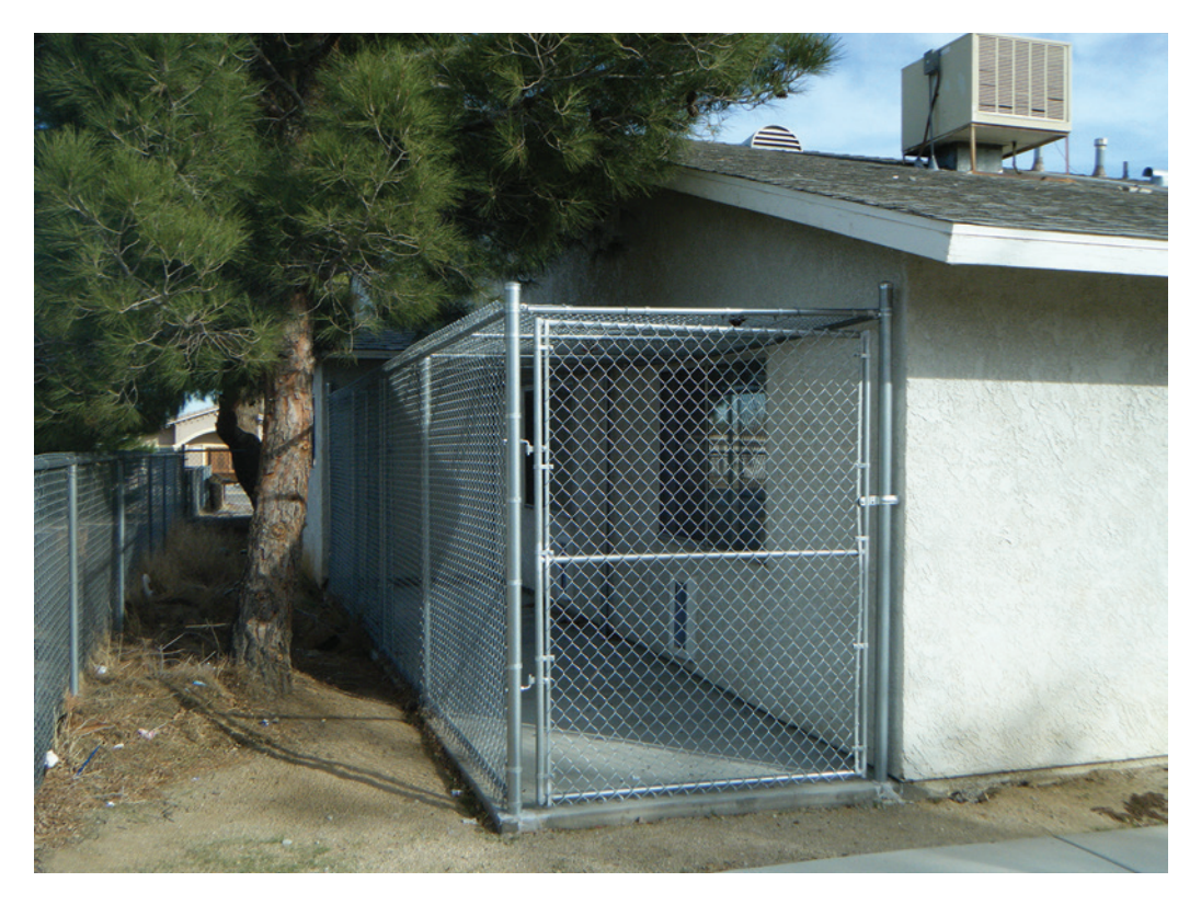
High Desert Domestic Violence Center in Victorville, California allows pets inside the residents' rooms and built on pet doors and screened-in pet play areas.

Sheltering Animals & Families Together (SAF-T) was created by the author of this publication after experiencing too many domestic violence victims returning to the abusive home to care for pets left behind. SAF-T sets forth written guidelines for domestic violence shelters to house family pets on-site in a safe, simple and affordable manner. Having this resource available in your community can make the difference between keeping family's safe or watching them return to an abusive home. There are far too many families who refuse to be separated from their pets, even during times of violence. We have seen this dynamic play out in numerous natural disasters, such as Hurricane Katrina and Super Storm Sandy, where pet owners stayed behind in the face of danger in order to protect and be with their pet. This human-animal bond can help the adult and child survivors to heal faster from past trauma. Please visit www.animalsandfamilies.org to locate a SAF-T shelter in your community, to download the SAF-T Startup Manual and other resources, and read more about how to implement SAF-T in your community.